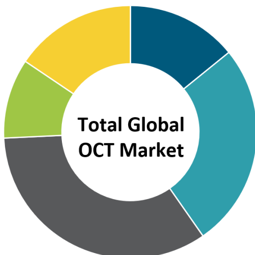
Global OCT Market by Category